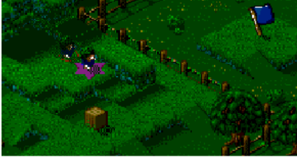
Something like this